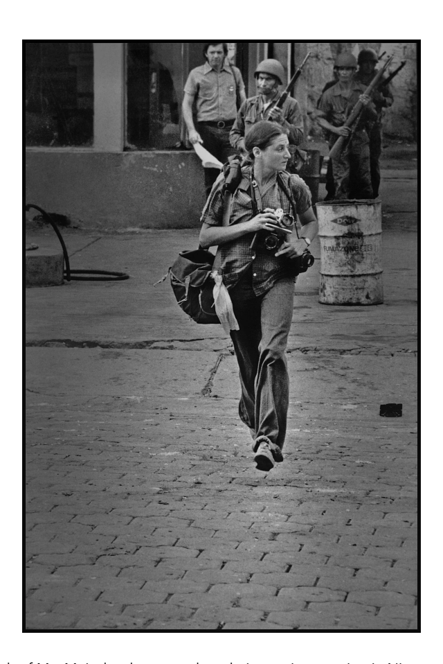
A photograph of Ms. Meiselas that was taken during an insurrection in Nicaragua in 1978.

So why, she wondered, was she receiving the first Women in Motion photography award from Kering, the Paris-based conglomerate that owns Gucci, Yves Saint Laurent and Balenciaga? Was fashion, which has been co-opting art photographers for some time, now turning its attention toward documentary and news domains to give its wares a more serious — or at least less frivolous — air?