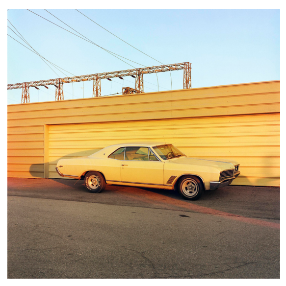
William Eggleston, Untitled , c. 1977

David Zwirner is pleased to present 2¼, a series of square-format colour photographs from the 1970s by American photographer William Eggleston. On view at 24 Grafton Street in London, the show marks the artist's first presentation at the gallery's UK location and his second solo exhibition with David Zwirner since joining the gallery, in 2016.