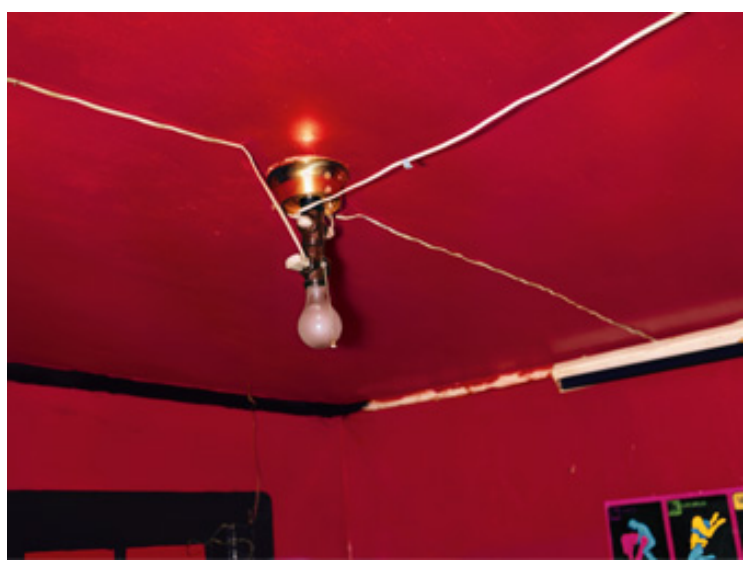
Untitled (The Red Ceiling), 1973.