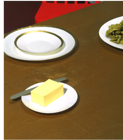
Thomas Demand, The Stove (2014)

By staging the books and prints together, BOUND AND UNBOUND examines the unique proposition that the book itself is not simply a vessel, but an additional artistic form that is dialogue with the photographic print. This exhibition becomes both a library and a gallery, a meditation on the multiple lives of photographs, and a testament to the enduring role of publishing in shaping the field of contemporary photography.