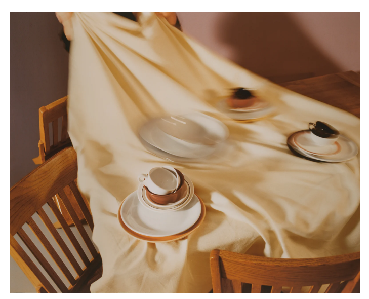
Jo Ann Callis, The Dish Trick, 1985

There is a quiet philosophy at work in Dish Trick , one rooted in the contrast between human impermanence and domestic stability. "Stability is an illusion," Callis