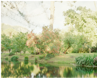
Elger Esser, Ninfa, Ouia [Soso], 2013

Elger Esser's photographs capture timeless European landscapes, emphasizing air, water, light, and reflection in a muted, dreamlike palette. Their large scale and stillness evoke the sublime, creating a tension between the seen and rendered landscape. Kawauchi's serene photographic meditations capture ephemeral moments in nature, blending soft light and subtle textures to evoke a sense of quiet wonder.