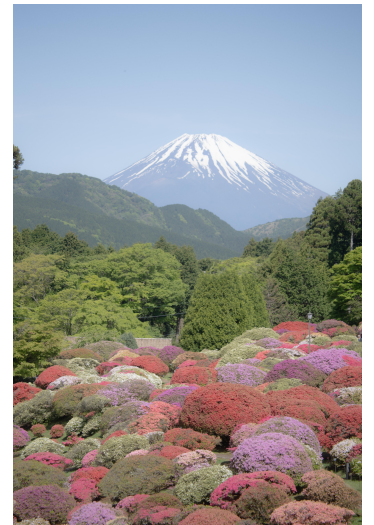
Rinko Kawauchi, Untitled, 2024