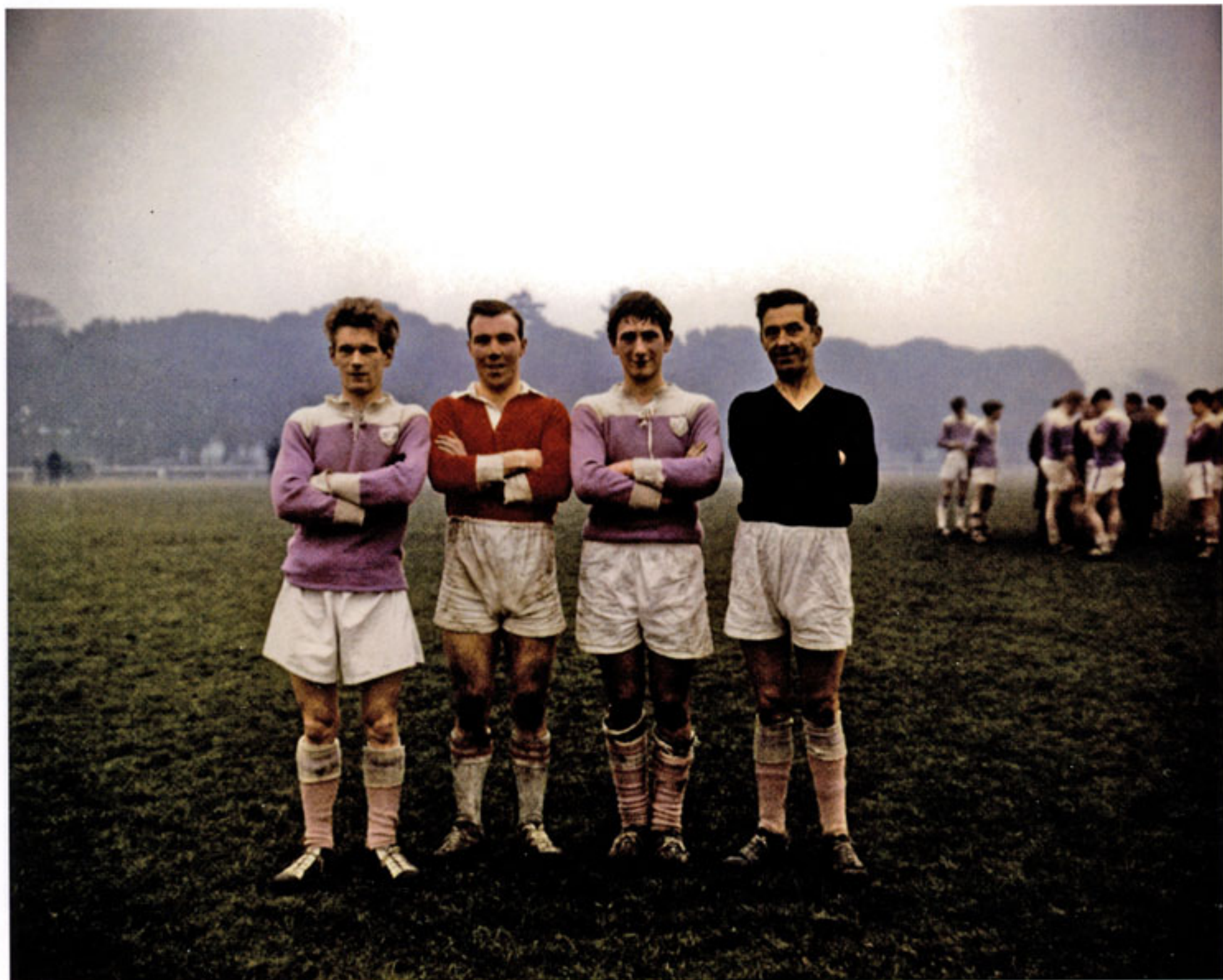
PHOENIX PARK ON A SUNDAY, DUBLIN—1966

ing photographs are physical by the very mechanics of her camera and the exactness of what it records. With a view camera, every blade of grass or word on a billboard can be read, offering detailed information that seduces a viewer. By contrast, a 35mm camera records quickly, oftentimes without the subject even knowing. But with a 4x5, Hofer's rapport with the people she was photographing, as well as their awareness of her, dramatically slowed down the picture-making process. The amount of time that elapsed between when she asked a person to pose and when she snapped the shutter affected how they responded to her, and she to them, with conversation undoubtedly part of the exchange. Who she photographed, and where, also reveals an attraction to male public image, not, perhaps, without some irony.