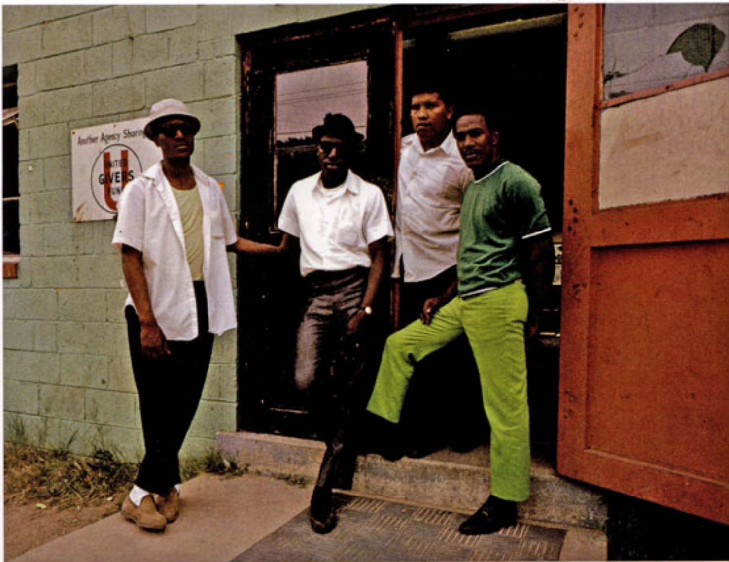
FOUR YOUNG MEN, WASHINGTON—1975