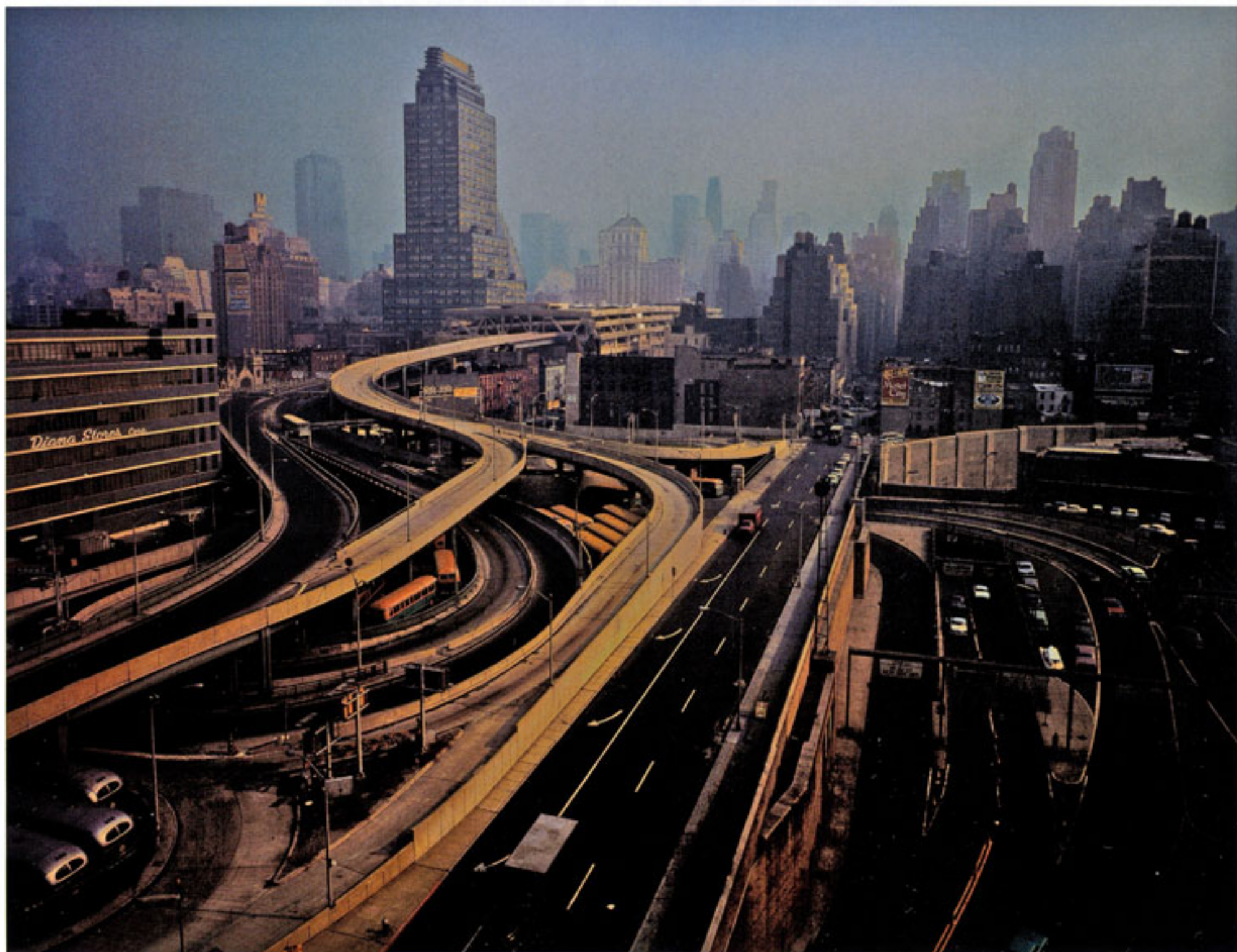
ARTERIES, PORT AUTHORITY, NEW YORK—1964