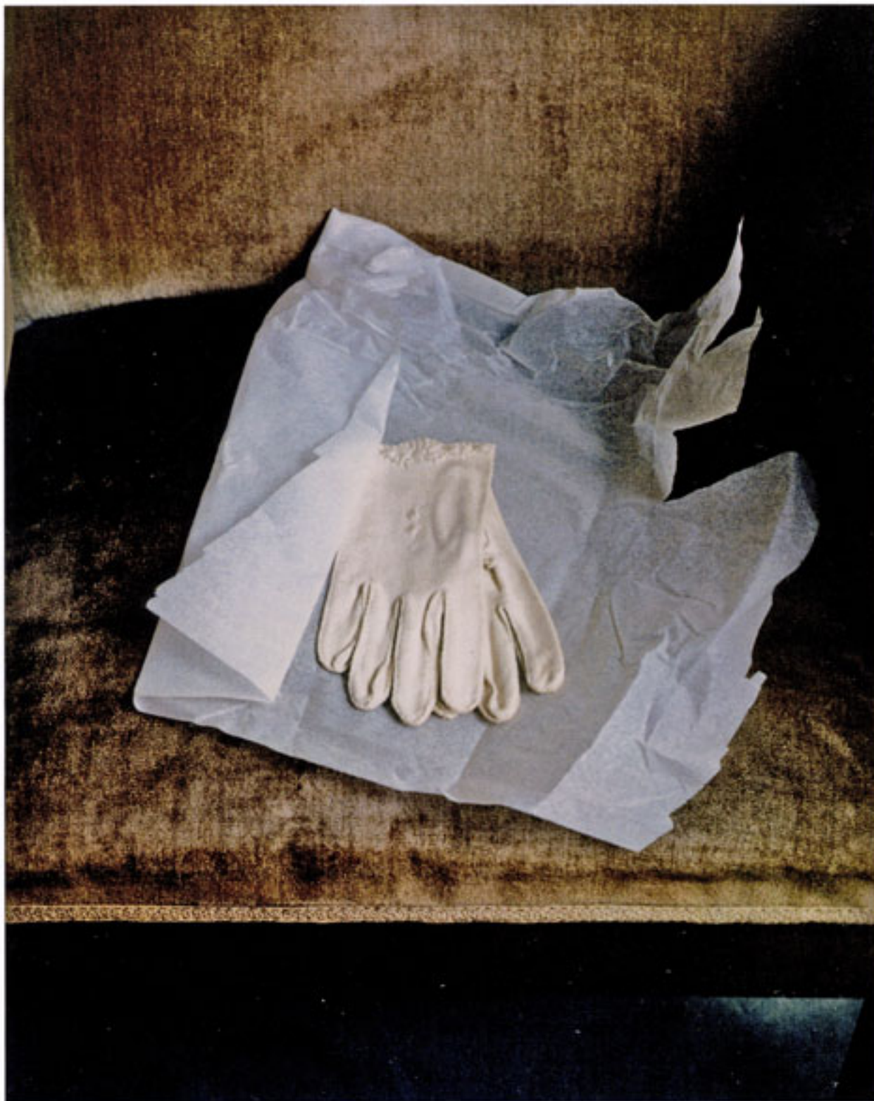
MARIANNE MOORE'S GLOVES—1983