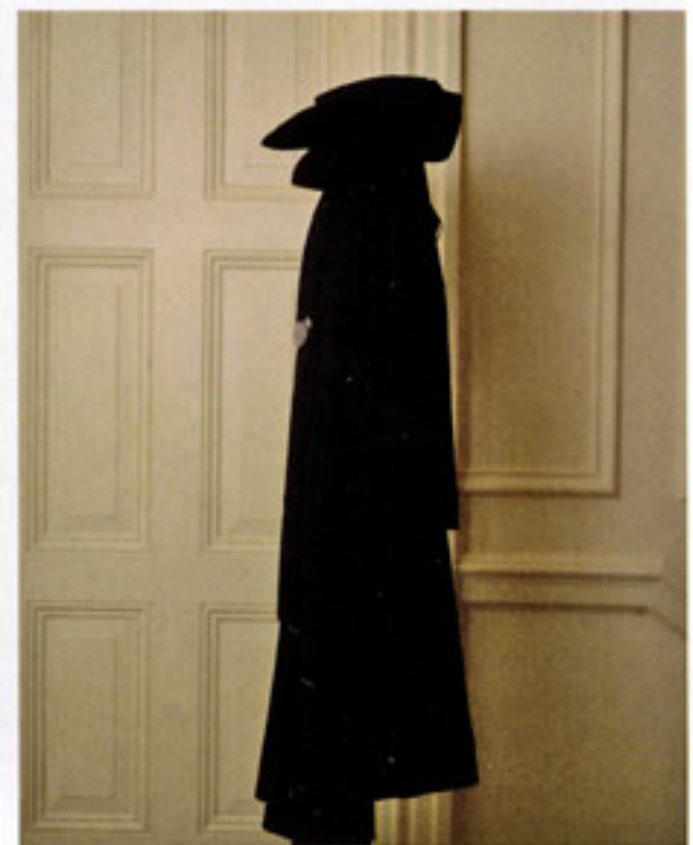
MARIANNE MOORE'S COAT, PHILADELPHIA—1983