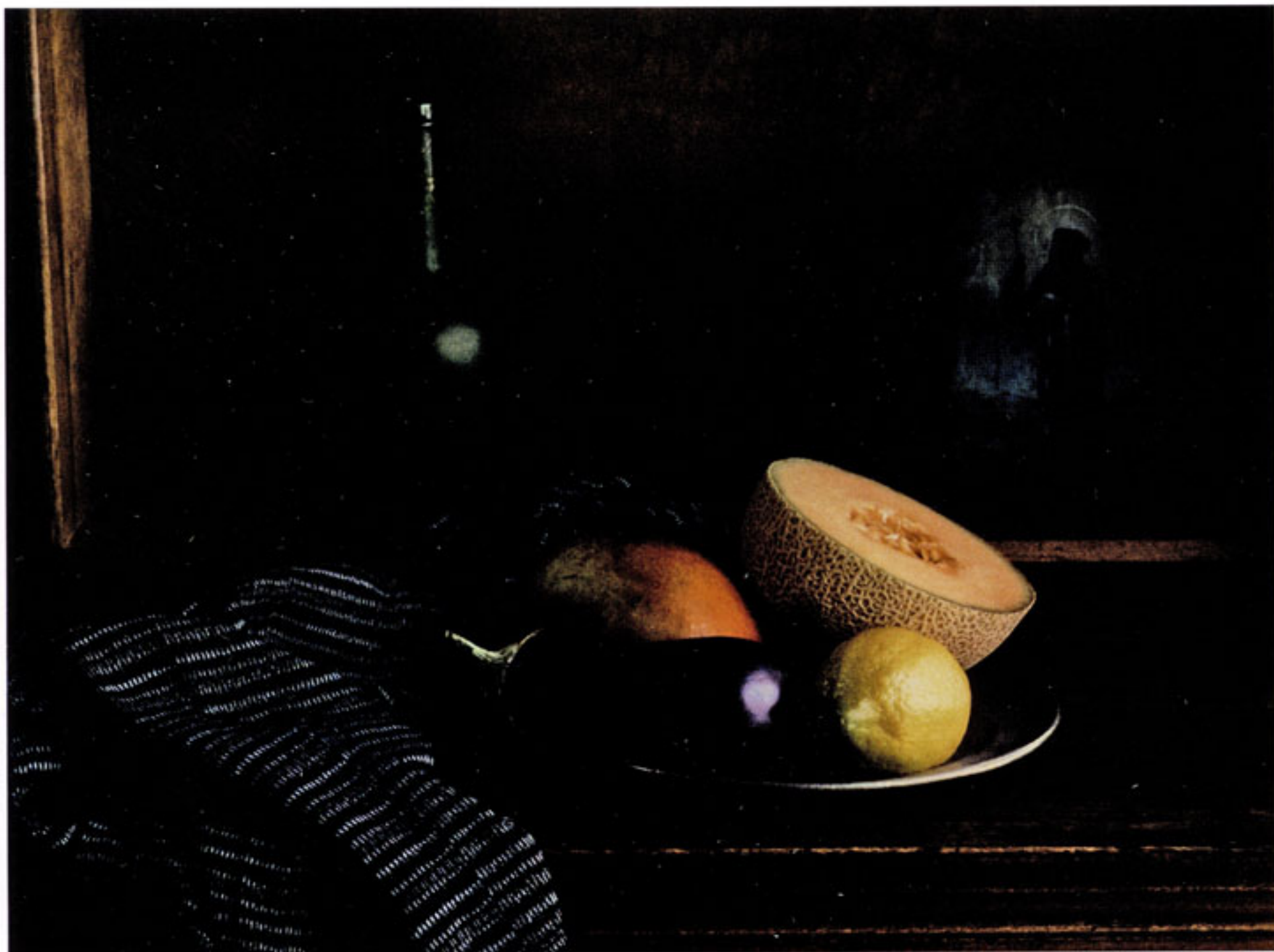
MEXICAN STILL LIFE WITH SAINT (STILL LIFE NO. 5), NEW YORK—1997