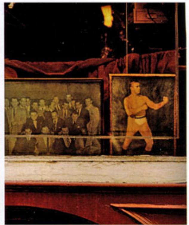
BAR, MERCER STREET, NEW YORK 1967