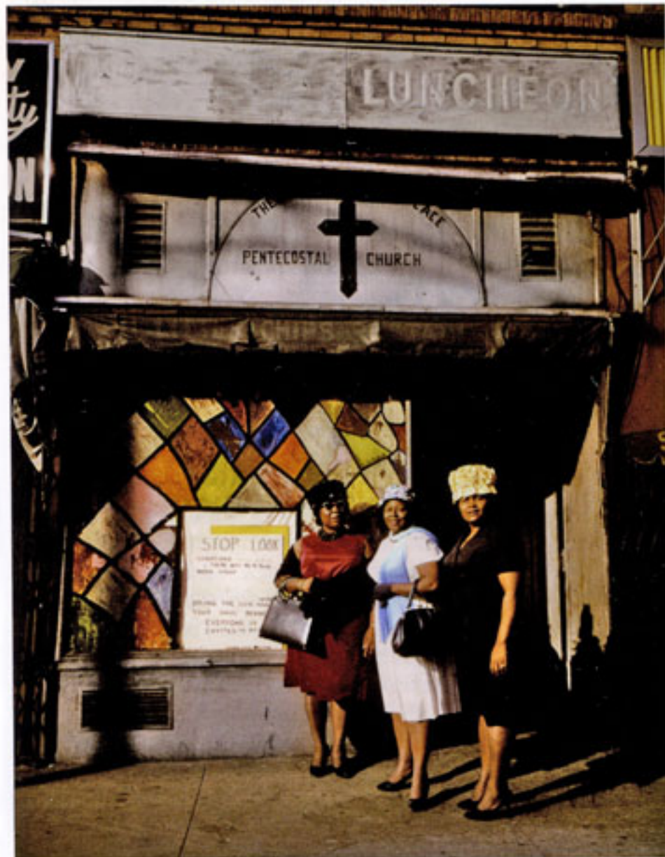
HARLEM CHURCH, NEW YORK—1964