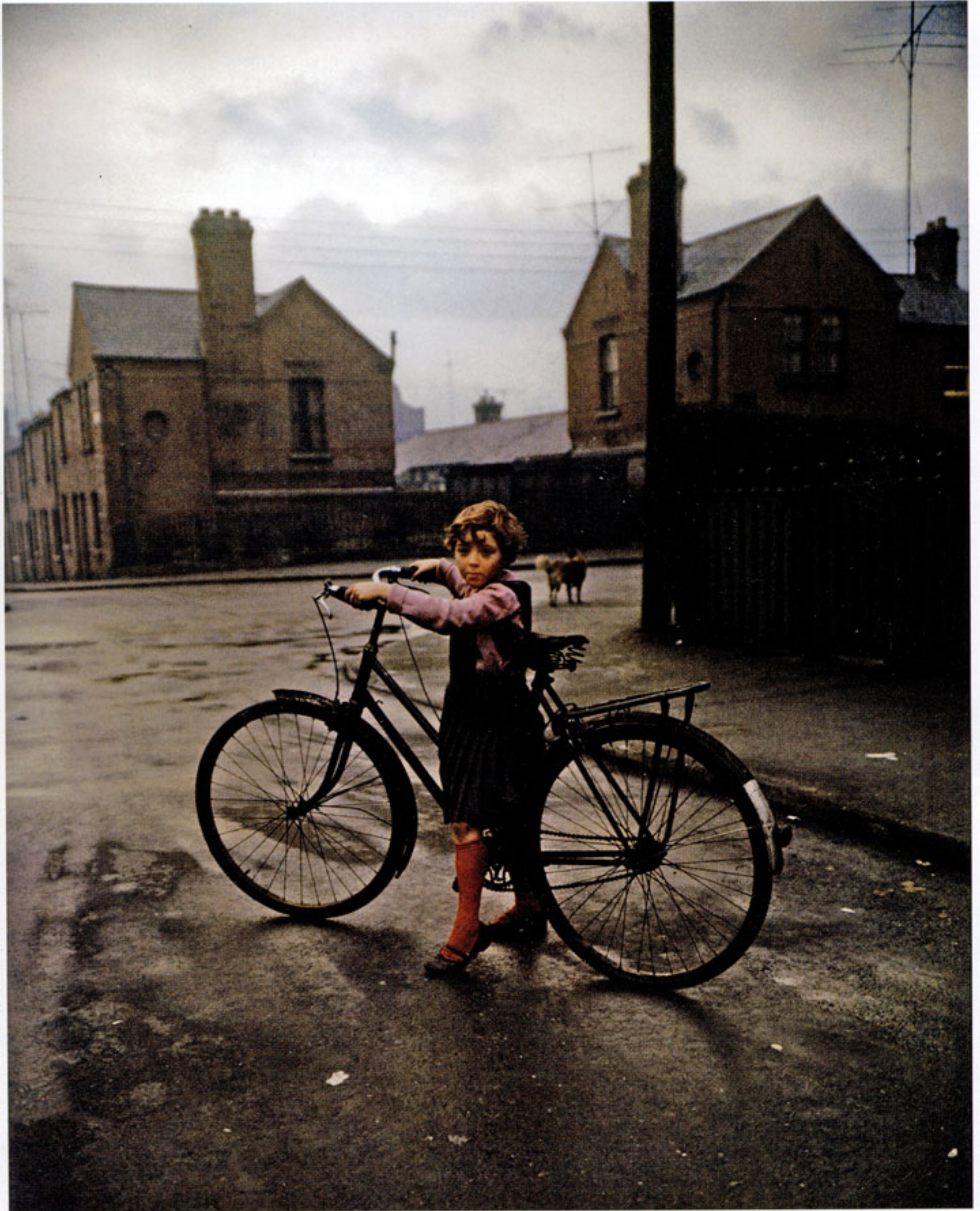
GIRL WITH BICYCLE, DUBLIN—1966