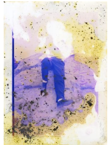
Melinda Gibson, Untitled IV , 2014

While revealing the processes behind its creation, Her First Meteorite, Volume II , works to deconstruct and complicate the universal "truth" of the photograph and challenge traditional forms of representation.